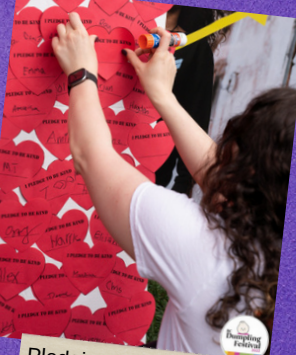
Pledging Kindness at the BC Dumpling Event