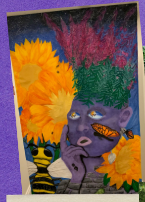
Contemplating Connections; Evolution of Change. youth Ambassador mural was hung up at the Coquitlam Library on Pinetree way